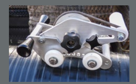
DEKOMAT®-Mini For small nominal pipe widths and confined space in the pipe trench.