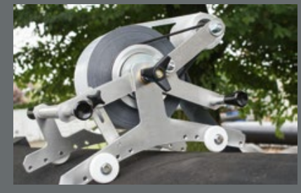
DEKOMAT®-KGR Junior For longer rolls and larger nominal pipe widths.