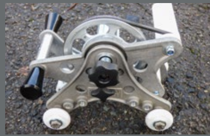
DEKOMAT®-1 Universal. Robust. Durable.