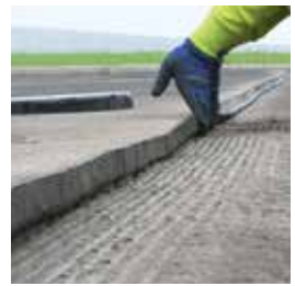
Apply TOK®-Band A