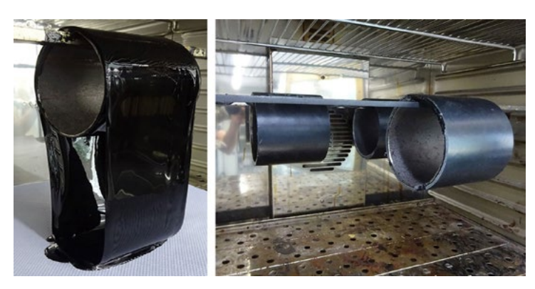
Figure 4. Material behaviour of PVC/bitumen tape (left) vs PE/butyl rubber tape (right).