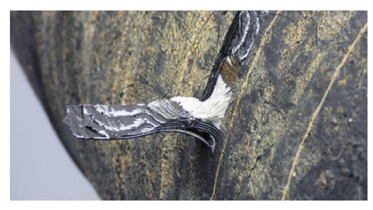
Figure 6. Cohesive separation pattern of a BUTYLEN PE/butyl tape after 40 years of project use.

discover pipelines have to be repaired after a short period because the bitumen has become hard, brittle and porous.