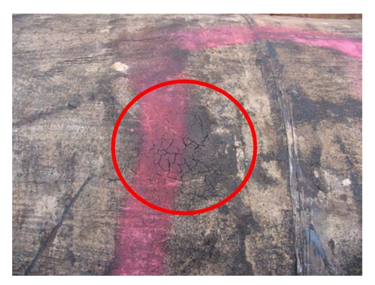
Figure 2. Cracks in the coating due to aged bitumen.